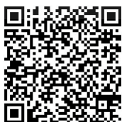
Awnings & Blinds e-Catalog