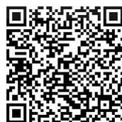
Sunbrella Awning & Marine Catalog